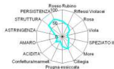
Cannonau di Sardegna, Nepente di Oliena Boinaglios

(In this wine the presence of a possible deposit is considered as a quality index)